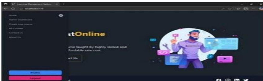
Fig-3: Admin Page

The Online Learning Portal's home page highlights the motto "Find out best Online Courses" with a contemporary, dark-themed design that is easy to read and connect with.