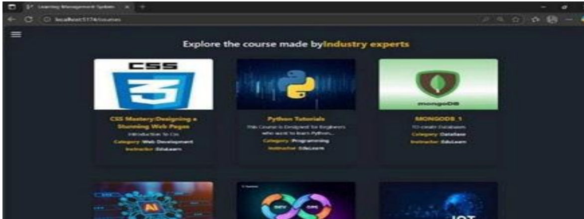
Fig-4: Student Courses Page

Examine a variety of courses in web development, programming, database administration, and emerging technologies that have been developed by knowledgeable experts. Every course is meant to impart real-world information and skills.