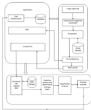
Fig. 4. Architecture diagram of stress detection system

In order to construct a new dataset with extracted attributes, the following are taken from the original dataset: Condition (No stress, Time pressure, Interruption), Stress, Physical Demand, Performance, and Frustration.