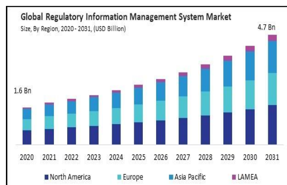
Figure 2: Regulatory Information Management System Market Size (Source: [19])