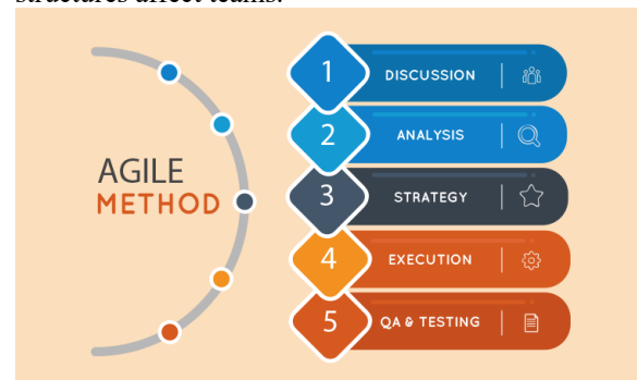
Fig. 2. Stages in Agile Analytics

The main benefits that motivate the implementation of the Data Mesh approach is faster analytics. Through the use of decentralizing data ownership and management, domain teams can independently generate, update, and access data products without the need to wait for a centralized team to process and disseminate the data [7]. This results in the faster assimilation of insights, as none of the common pitfalls associated with inefficient information structures affect teams.