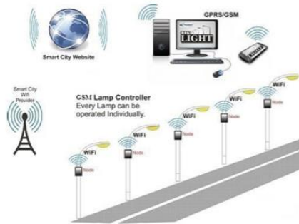
Fig 1. Street light controller with wireless technology

Thus message is decide whether the street light should ON/OFF by the help of gsm and microcontroller circuit It enables regulate their communication strategies according to dynamically changing network environment. Street lights should work on the systematic manner by the help of circuit and huge reduction in power consumption on whole around the world it is -less costly and effective in manner .it should reduce the time wastage of human effort and control from one place or any common panel. Provide the better efficiency to do work